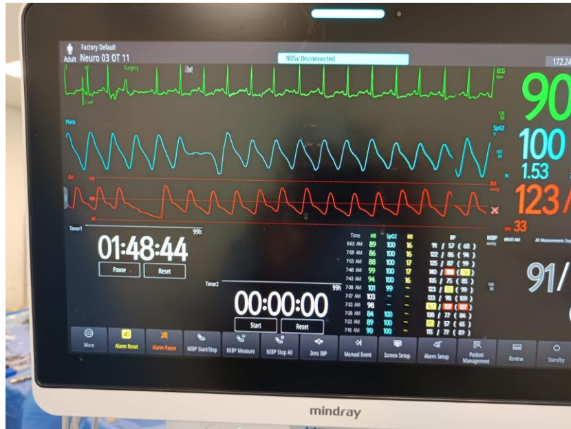
Fig.1. ECG tracing showing QTc prolongation, evidenced by an increased distance between the QRS complex and the T wave.